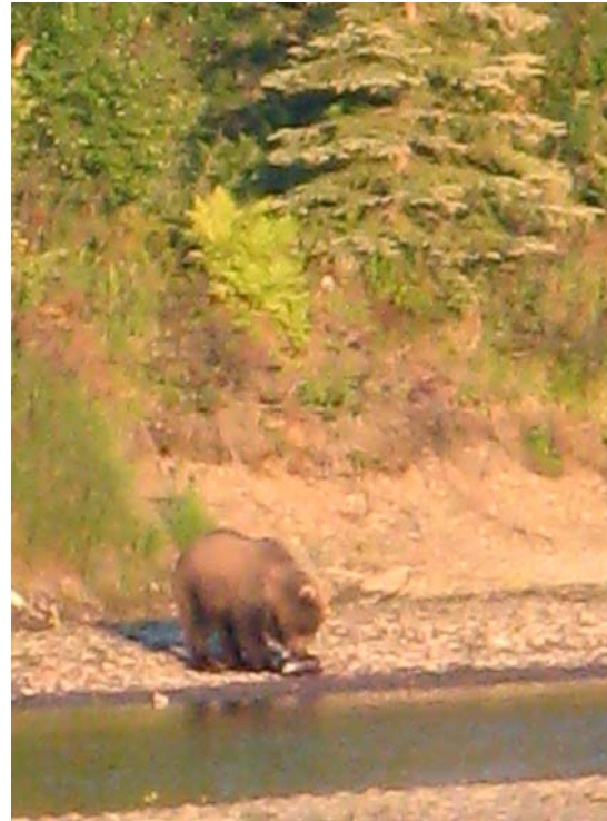
Figure 2. A bear eating a sockeye salmon on the Mulchatna River, Alaska.

The most appropriate expenditures of limited financial and human resources for salmon conservation can then be made on the basis of maximizing potential return on investment (e.g., recovery and sustainability of wild salmon populations) rather than expenditures on areas with relatively low salmon production potential.