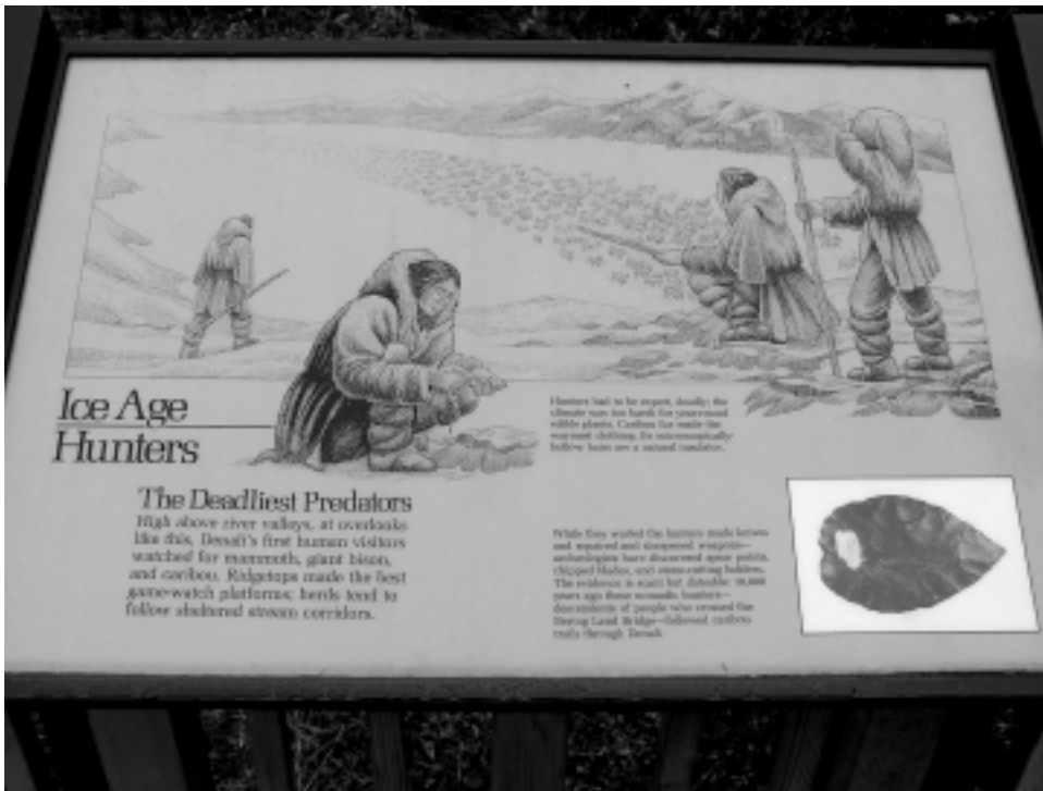
Figure 1—More than 10,000 years ago people followed caribou trails through what is now Denali National Park and Preserve.

After a good supply of fish was cut, dried, and stored for the winter, the men, women without small children, and children old enough for the walk headed for the park area to hunt. After upstream travel by canoe was constrained, each person would proceed with just what they could carry in a pack, walking the river bars of the then-braided stream toward the mountains. There they would hunt and dry meat until they had enough hides to make a skin boat and enough meat to fill it up, then rejoin those who had remained in other camps downriver. After freeze-up the young men would be sent back out to the foothills to hunt for meat for the entire village (Collins 2004).