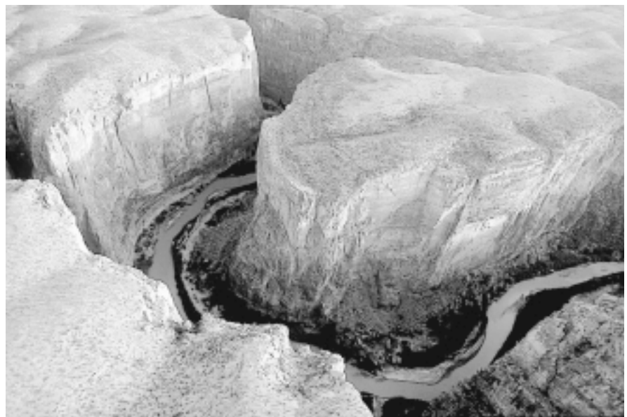
The Rio Grande (US)/El Bravo (MX) River cutting through a canyon on the Texas/Mexico border.

Finally, one of the most important stakeholders of the region is CEMEX, the third largest cement producer in the world. This corporation presented a great opportunity to Agrupacion Sierra Madre when they asked us to help them strengthen their commitment to the natural world. In 1995 we presented to them the importance of El Carmen. Today the company owns