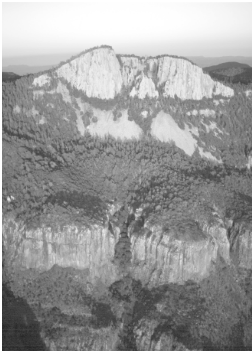
Sierra del Carmen, Coahuila, Mexico, the location of the first designated wilderness in Latin America.

Second, Mexico's system of land tenure is a significant factor for the status of our protected natural areas. There is a saying that Mexican land has been given "several times" to its people. After the agrarian reform, a high percentage of the land was held under communal private property, or ejidos . This means that there is virtually no public land, so the government cannot unilaterally set aside protected areas. Integrated, complex efforts are required. This makes conservation of wilderness and biodiversity a singular and interesting challenge, because the general public has almost no access to wild open spaces. In all the other countries that have wilderness legislation, the experience of wild nature by the public has been instrumental in creating the movement and subsequent legislation. Mexico essentially lacks a popular cul-