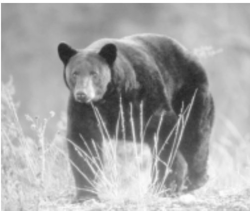
Black bear ( Ursus americana) are abundant in the El Carmen area.