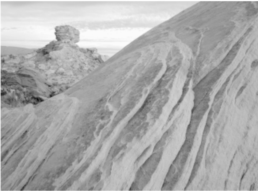
Rock formations in Big Bend National Park, Texas.

almost 195,000 acres (78,947 ha) inside and outside the FPPA (Maderas del Carmen), and through conservation partnerships manages another 62,500 acres (25,303 ha). Its conservation activities include the rewilding of this sky island through intensive habitat restoration programs, the removal of all fences and cattle, and the reestablishment of big mammals such as the desert bighorn sheep—a flagship species that represents the true historic wilderness. The northern end of this mountain range, bordered by the Rio Grande River and Big Bend National Park, is remote and without human disturbance. Big Bend has struggled to be declared a wilderness area since 1978, when the park staff (concerned by the increasing number of visitors) proposed 79% of the park's surface as a wilderness area. Some local residents opposed the initiative, fearing it would limit tourism opportunities. A strong debate ensued, but the U.S. Congress didn't pass the proposal. However, since then, park administrators have been managing most of Big Bend's area as a de facto