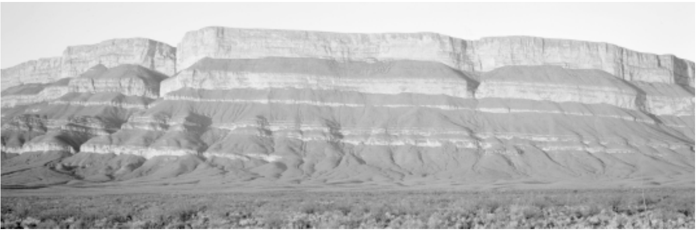
El Jardin escarpment of Sierra del Carmen, a “sky island” in the Chihuahuan desert.

areas that comprise one of the biggest high-biodiversity megacorridors in North America. In the last year Agrupacion Sierra Madre has focused its efforts on the promotion of El Carmen-Big Bend Conservation Corridor Initiative, a conservation initiative that holds one of the most diverse arrays of conservation models in the world, ranging from government protected areas to a private protected area managed by a corporation. If we only focus on the government’s protected areas we can see that four different models coexist in this area. Maderas del Carmen (520,000 acres; 210,526 ha) and Cañón de Santa Elena (693,000 acres; 280,566 ha) are both FFPAs managed by the Mexican central government’s National Commission for Protected Areas (CONANP). Ocampo is a new FFPA of 680,000 acres (275,300 ha) that will be declared between them. On the U.S. side, Big Bend National Park (800,000 acres; 323,886 ha) has on its eastern flank the Black Gap Wildlife Management Area (119,000 acres; 48,178 ha) and on the west, Big Bend Ranch State Park (300,000 acres; 121,457 ha), both managed by the Texas Parks and Wildlife Department. Together, all these reserves protect a surface of more than 3 million acres (1.2 million ha).