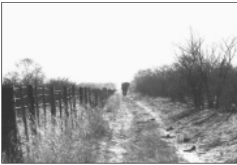
Figure 4—An elephant bull walking along the northern Buffalo Fence in November 1997. The bull has been separated from the rest of the herd by the fence (Kalahari Conservation Society 2005).

Buffalo Fence is reportedly one of the most destructive fences to migratory wildlife species in the region (Albertson 1998). The fence cuts across an area that is described to be a major route for migratory wildlife species to and from dry and wet (Okavango Delta) areas. Albertson (1998) stated that the Northern Buffalo Fence not only cuts off the larger migratory patterns of zebras, wildebeests, and elephants, but also fragments and restricts the movements of localized populations whose territories it bisects (see figure 4). Albertson indicated that wildlife species mostly affected are eland, roan, sables, tsessebes, and giraffes.