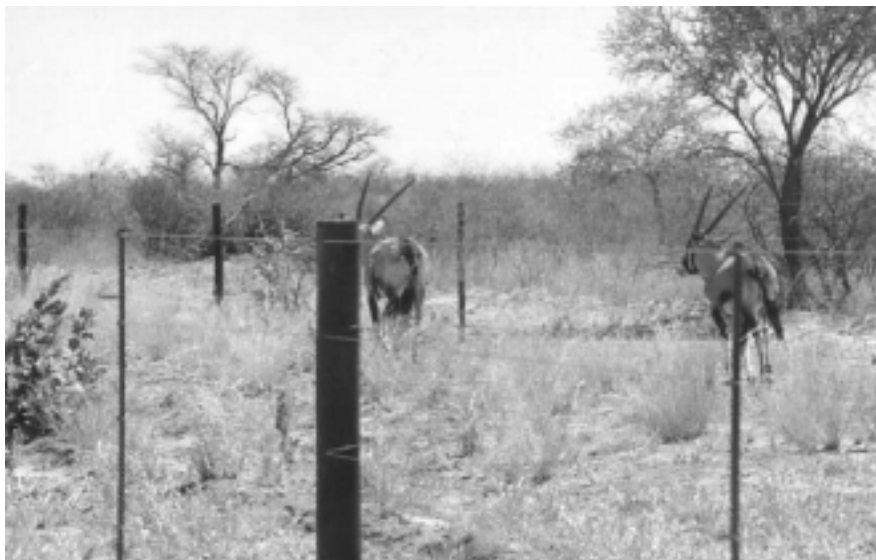
Figure 6—Gemsbok between fence lines in 1998 (Kalahari Conservation Society 2005).

(p. i). The Kalahari Conservation Society study further indicated that the removal of the Setata Fence has led to free movement of wildlife over the old fence as shown by seasonal migrations of elephants, zebras, and wildebeests. In addition, gemsbok and hartebeest populations observed in 1997 and 1998 comprised very small, scattered adults of fewer than five animals or sedentary lone adults or calves. Those herds in 2005, after the fence was removed, were typically larger and more cohesive, with numbers and age structures within normal ranges. With regard to the Nxai Pan Buffalo Fence, the study assumed that wildlife populations, particularly elephants, buffalo, and zebras, are likely to return to preferring levels over the long term. These results indicate that wildlife populations in the Okavango Delta can be reversed if some of the veterinary fences were to be removed.