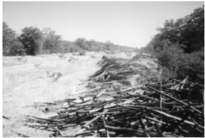
Figure 8—Standards prepared for collection (Kalahari Conservation Society 2005).

with funds by the European Union through the Cotonou Agreement (Perkins 1996; Perkins and Ringrose 1996, Grag Gibson/Environmental Investigation Agency 2004). The involvement of the European Union in Botswana's beef industry is part of globalization and international trade. Globalization and international trade are important in the economic development of any country; however, they also encourage development programs and strategies that can cause negative environmental impacts. The case of veterinary fences and wildlife decline in Botswana is one example of this phenomenon. Instead of promoting the sustainable use of Botswana's wildlife resources, globalization and international trade are thus contributing to the depletion of its wildlife resources. This problem can partly be addressed by encouraging livestock policies and programs that adhere to principles of sustainability in Botswana. This can partly be achieved through the integration of wildlife management and livestock production programs. This approach means that none of these sectors (livestock and wildlife) should be given priority to the detriment of the other, as is the case with the erection of veterinary fences.