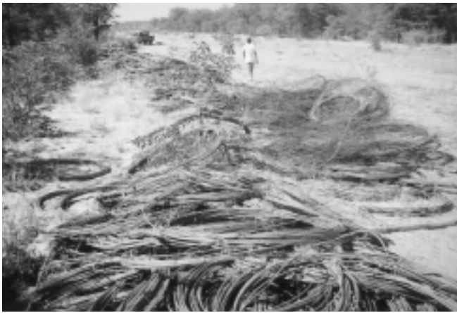
Figure 7—Cables prepared for collection (Kalahari Conservation Society 2005).