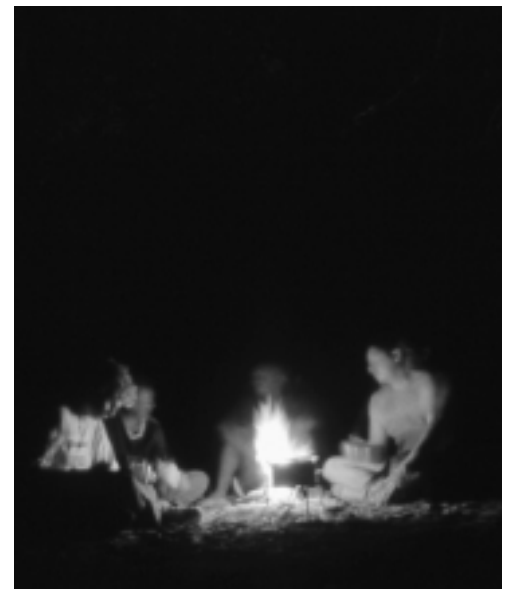
Night watch around the camp fire, wilderness trail iMfolozi game reserve.