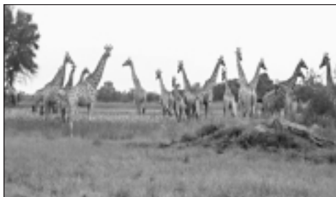
Figure 2—Giraffes in the Okavango Delta.

although Botswana has one of the most comprehensive game laws in Africa, there are fears about the sustainability of wildlife resource utilization, as wildlife populations are in a state of constant decline.