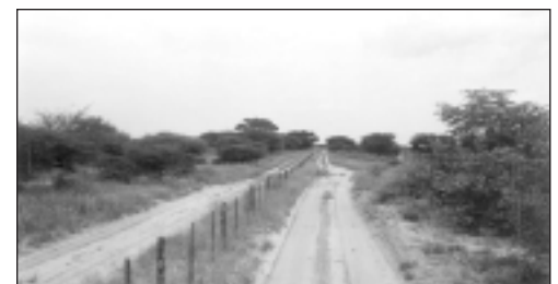
Figure 3—The Southern Buffalo Fence.

The Buffalo Fence is one of the important fences in Botswana in that it controls the spread of foot-and-mouth disease in the Okavango Delta region. The Buffalo Fence runs from the south to the north of the Okavango Delta. The fence has succeeded in keeping buffalo populations, which are known for transmitting foot-and-mouth, within the inner parts of the delta separate from cattle populations that remain in the outer parts of the country. The Buffalo Fence is divided into the Southern Buffalo Fence erected in 1982 and the Northern Buffalo Fence erected in 1996. The