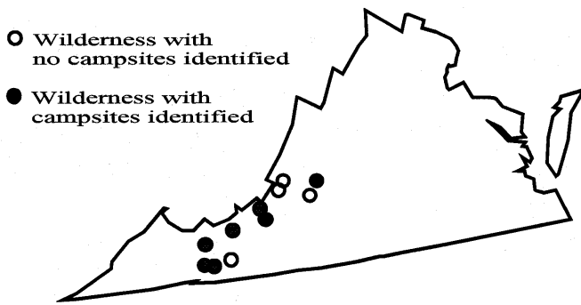
Figure 1—Location of the wilderness areas included in this study.

accommodated by three areas: Lewis Fork, Mountain Lake and Little Wilson Creek Wildernesses (table 1).