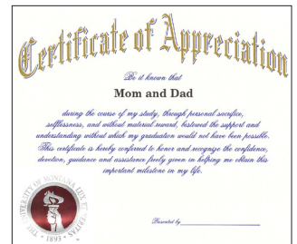
Certificate of Appreciation