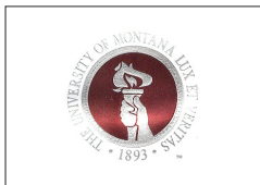
Custom Seal Notecards

Personalized Graduation Announcement Prices: $48.75 for first 25. $9.75 for each additional group of 5.