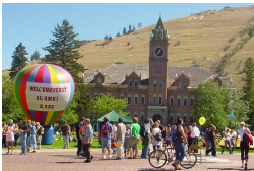
Hosted by Student Affairs, WelcomeFEAST takes place on the UM Oval every September