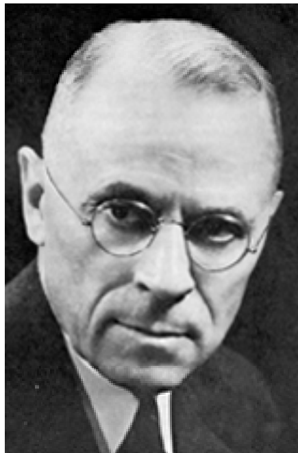
Edwin Sutherland 1883-1950