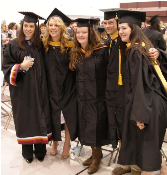
2008 M.A. Graduates

Thursday, Nov. 19 th , 3:45 PM University Center, Room 330