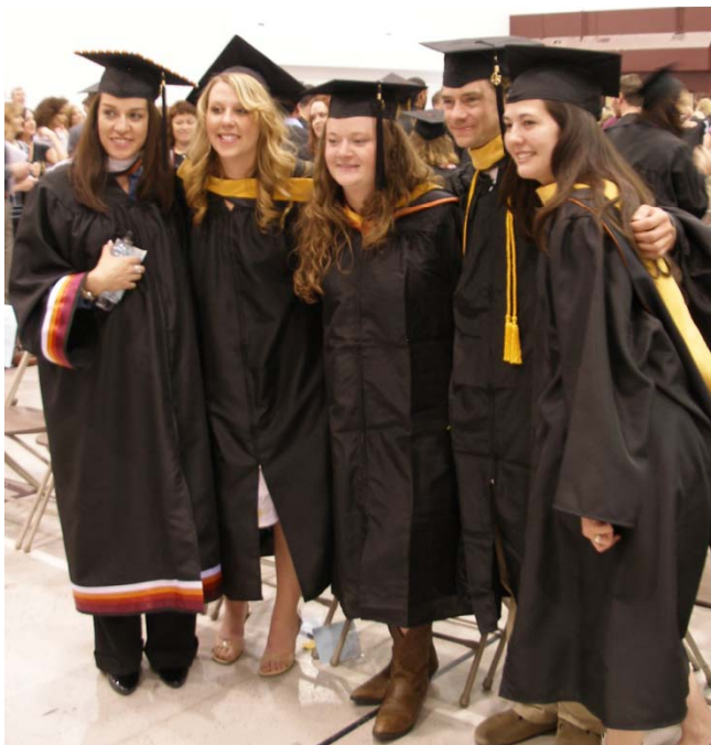
2008 M.A. Graduates

Thursday, Nov. 19 th , 3:45 PM University Center, Room 330