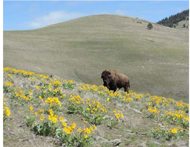
Bison grazing at the National Bison Range, Moise, Montana.

University of Montana Graduate Student Helps RM-CESU Federal Partners Understand the Relationship of Bison Grazing to Grassland Bird Populations A number of the Rocky Mountains CESU Federal partners have similar ecosystem integrity and species persistence issues. Comparative studies of sites in a National Park (Yellowstone) and a Fish and Wildlife Refuge (National Bison Range) can help managers understand ecological trends that can be extrapolated to other western landscapes. The RM-CESU has been a catalyst for agency managers to use graduate student research to help with on-the-ground management of species and natural resources.