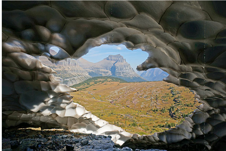
A view of Going-to-the-Sun Mountain through melting snow and ice at the origin of Reynolds Creek near Logan Pass in Glacier National Park, Montana.