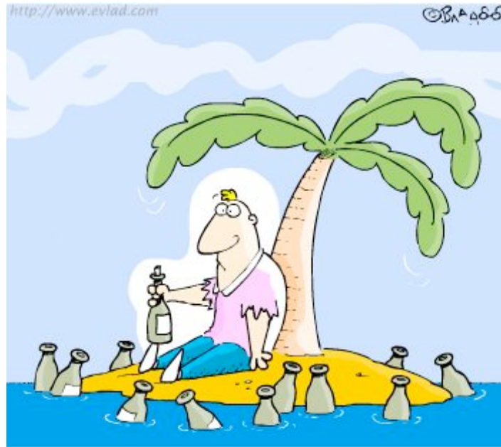
That island did not have a Spam filter...