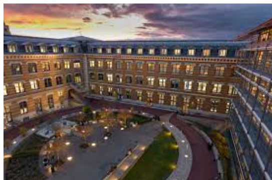
Google Images of Université Jean Moulin

“ Studying abroad is an absolutely incredible experience, but it's not going to be like the movies, nor will it be like an extended vacation. There are good, bad, and ugly sides to exchange, and each day is a little different. ”