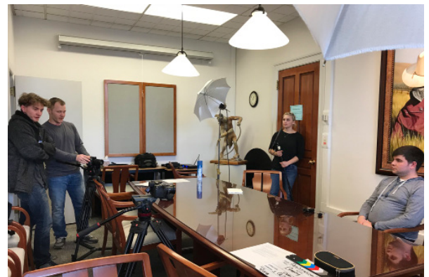
KPCN Team on set

We employ a high-touch collaborative process with our clients. From concept meetings to close captioning the final product, our student staff continuously works with clients to find innovative ways to reach designated audiences. Students exercise leadership, demonstrate professional communication skills, and align production decisions with client's resources, needs, and wants. We do this by understanding the project, its goal, the budget, and the audience.