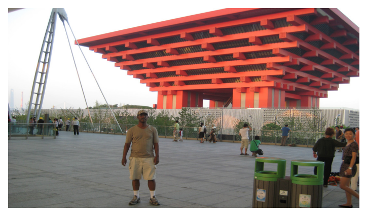
Pictured with the China Pavilion at the World Expo 2010

We hit Shanghai amid days of record-high temperature and humidity (high for the day 102°F and 90%, respectively). It was right in the middle of August, the warmest month of the year. Located in the middle portion of the eastern costline of China, Shanghai is home to 23 million people. The road traffic, massive number of pedestrians and roadside businesses all contribute to the commotion and chaos in the city. Incidentally, Shanghai has seen a noticeable expansion and development since my last visit in summer of 2007. The addition of three new subway lines, many highways (some of them elevated) and many architecturally - as well as structurally - fancy high rise buildings have definitely enhanced Shanghai's capacity to host the 2010 world expo.