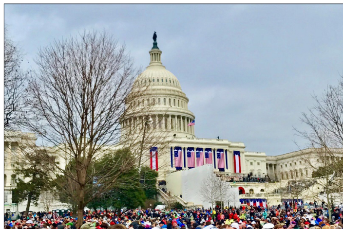
An exciting time to be in D.C. Picture taken at the 58th Presidential Inauguration, United States Capitol

Finally, although the mountains and big skies of Montana are deeply missed, life in D.C. has been wonderful. Missoulians would be proud of how accessible the city is