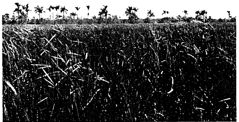
located in northern Matanzas province, the 452,000-hectare (1,116,440-acre) Zapata Swamp is an amazing wilderness and one of Cuba's most important natural areas.

Zapata Swamp flora is characterized by high species richness (13% of the country's flora); however, it does not stand