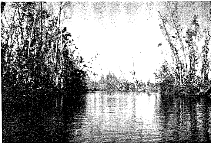
Evidence of poaching and illegal logging has been detected in remote zones where canals constructed for logging early in the century make access easier.

(CNP 1996). This is a significant number for the Caribbean insular region. The presence of three local endemic bird species, which are endemic genera of Zapata Swamp, and an endemic species of mammal (all of them considered critically threatened), provide this wetland with a special status. The frequency of endemic faunal species in Zapata Swamp is noteworthy due to their local significance rather than their total numbers, the criterion most commonly used when making comparisons with other areas. In this wetland is found the only endemic crocodile species of the Caribbean insular region, the Cuban crocodile. Zapata Swamp is also the only area in which the eight endemic bird genera of Cuba cohabitate.