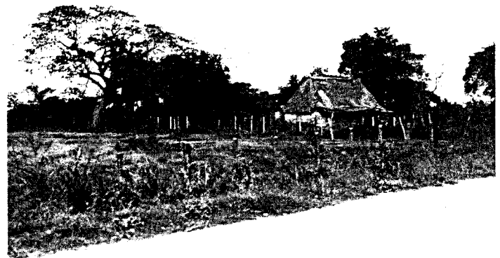
New strategies for Zapata Swamp management depend on community involvement. Cuban home, Nojasa, Cuba.

Currently, new strategies for Zapata Swamp management depend on active community involvement. Community involvement is being introduced to all sectors and stakeholders of Zapata Swamp as part of a project of international cooperation with World Wildlife Fund (WWF) Canada and the Canadian International Development Agency (CIDA). Local communities have most of the responsibility for this project, which is making an important contribution to wilderness management in Zapata Swamp. The development of plant nurseries for sustainable development projects in communities highly dependent on protected area resources are pilot projects that have been carried out. Positive conservation results are being realized, but the increase in local interest and involvement by remote community