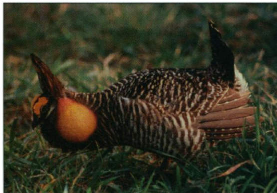
Spring booming. Prairie chickens still thrive in a few areas of native grasslands, where courting males stomp their feet while making hollow moaning sounds.

Conservation geneticists have argued that in small populations the extinction probability should increase over time because these genetic effects magnify the extrinsic sources of jeopardy, including disease, inclement environmental conditions,