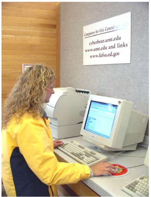
A Student Using a Griz Central Computer Station

Auxiliary enterprises of The University of Montana are expected to be entirely selfsupporting in revenue and are not relied upon to generate surpluses for the general and educational operations of the University.