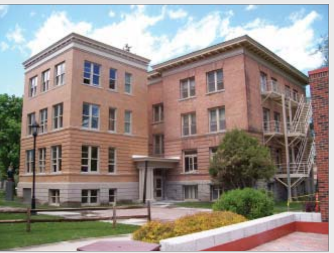
Mathematics Building with Elevator, 2008

Condensed article from June 08 Main Hall to Main Street