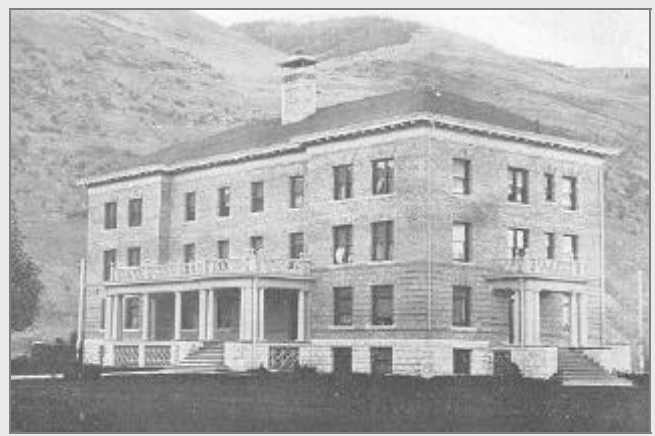
Women's Hall, 1903

The University's Mathematics Building on the Oval was constructed in 1903 as the Women's Hall, one of the first four buildings on campus and the first dormitory. The building was designed by the famous architect A.J. Gibson. It was converted into a classroom building for mathematics and physics in the 1920s.