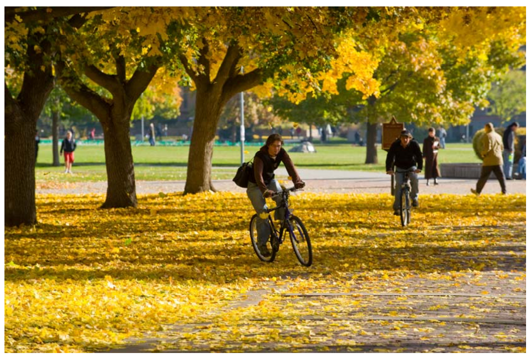
Students Riding Bikes on Campus