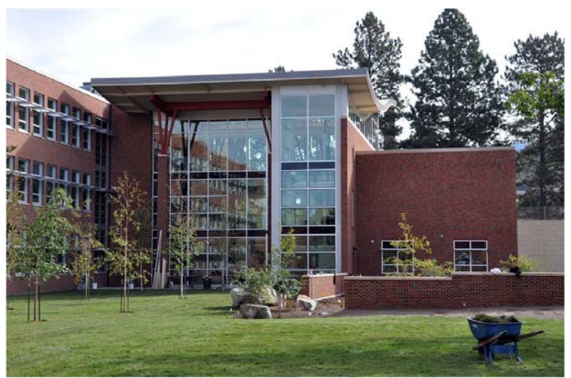
Phyllis J. Washington Education Center

Since the 2000 accreditation visit, the campus has invested approximately $6,200,000 in projects to renovate classrooms, with state funding totaling approximately $1,400,000. During the same period, the campus has funded $88,400,000 in new construction of academic facilities which included new class/lab space. Of this total the state funded approximately $10,500,000. This new construction increased the total inventory of class/lab space by approximately 7%. The School of Law addition and the College of Education and Human Sciences Building addition were completed during the Autumn 2009 Semester, and the Native American Center is scheduled to be completed in January of 2010. These new facilities will add approximately 20,600 GSF to the classroom inventory, or another 4%, totaling 11% for the accreditation period. The space inventory for the class/lab category has grown to 517,513 GSF, or 55 additional spaces allocated to classrooms and laboratories. The campus, through the Office of the Provost, has initiated a program starting the summer of 2009 to fund approximately $500,000 per year for the next five to seven years for Classroom Instructional Equipment Improvements. This program is intended to upgrade and maintain all of UM's classrooms with modern instructional equipment.