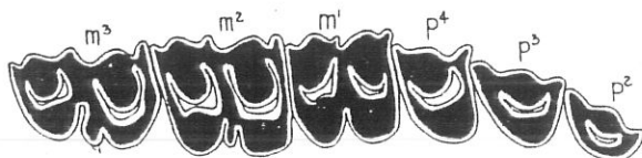
Upper tooththrow of Bison