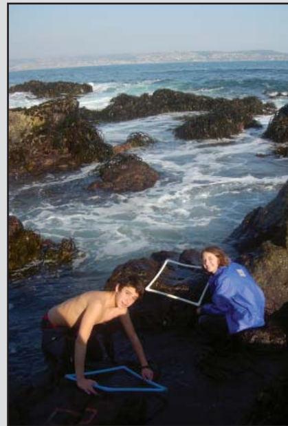
Three internship opportunities in three different locations: HIV awareness program in Tanzania (top picture); Coastal Marine research station in Chile (middle picture); and Cheetah Conservation Fund in Namibia (bottom picture).