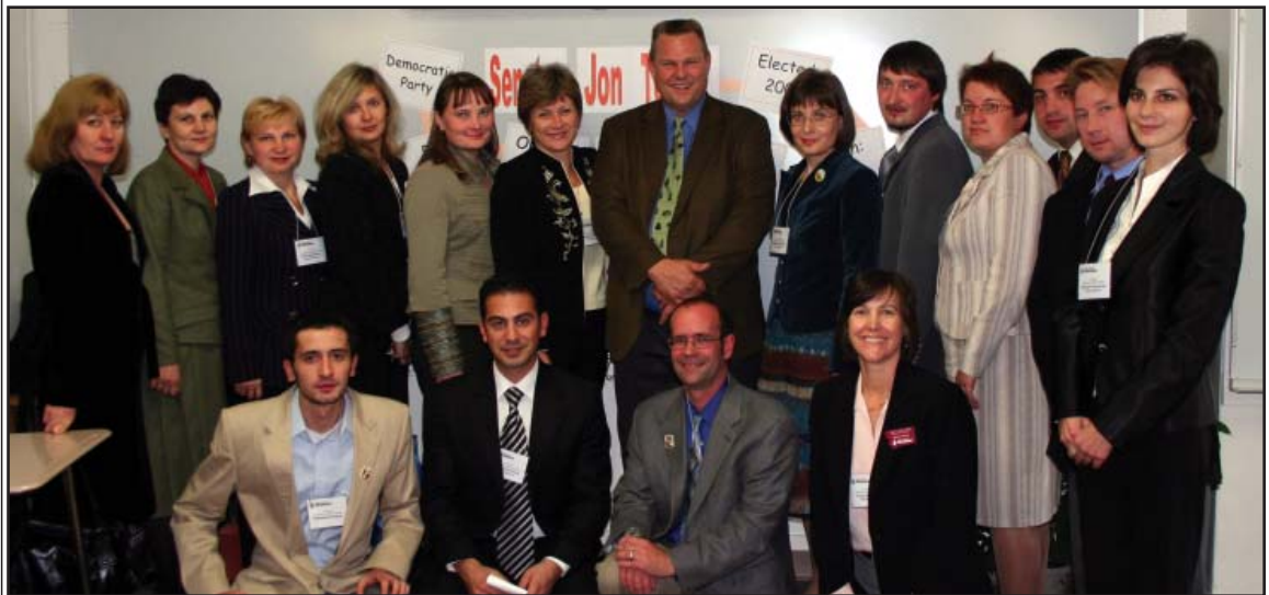
Russian Teacher Training Program participants with Senator Jon Tester at Hellgate High School.

Faculty and staff of The University of Montana's (UM) International Programs, the English Language Institute and School of Education's Division of Education Research and Service partnered this semester to provide an enriching training program for eleven visiting Russian educators participating in the Teachers to Teachers: Language, Technology, Math, and Science Exchange (LTMS). LTMS is a program within the Bureau of Educational and Cultural Affairs, United States Department of State, and administered by the American Councils for International Education: ACTR / ACCELS. The goal of LTMS is to identify and reward Russian educators with concentrated professional development, short-term internships, and workshop design. LTMS provides Russian educators from across the curriculum the opportunity to collaborate with U.S. counterparts to develop new teaching methods, create or expand materials and curricula, and to prepare professional development workshops for colleagues in their home country.