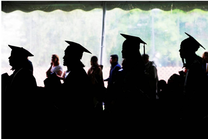
Graduating seniors line up to receive diplomas at Wellesley College in Wellesley, Mass.

The message that we try to impart is clear: Parents and students must work on a different attitude toward the classroom long before they start thinking about which college to attend. It's never too early to foster the skills needed for a healthy and meaningful college experience.