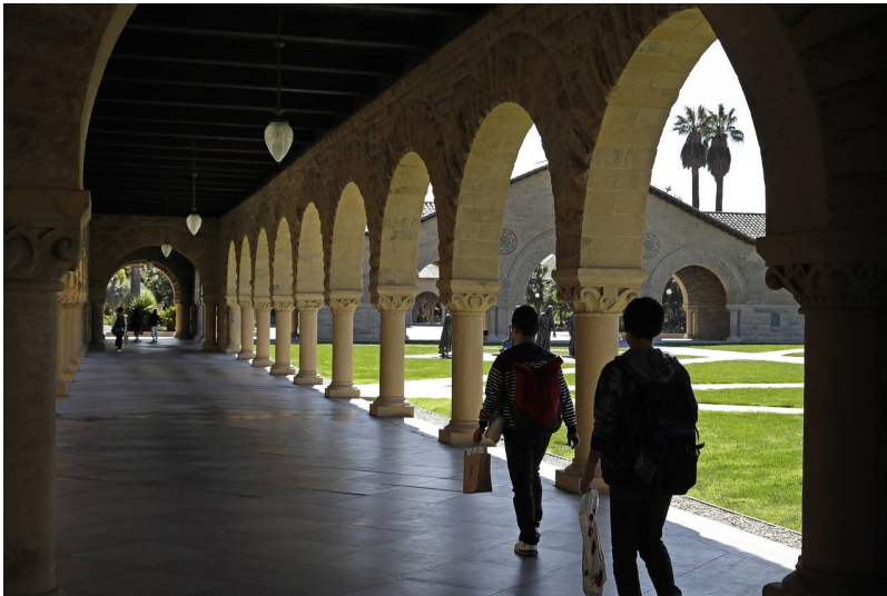
Students stroll across the Stanford University campus.