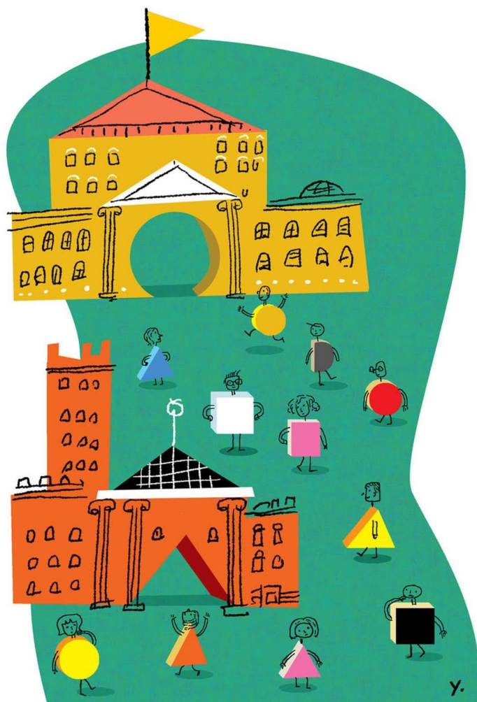
ILLUSTRATION: JAMES YANG

What students do at college matters much more than where they go. The key is engagement, inside the classroom and out.